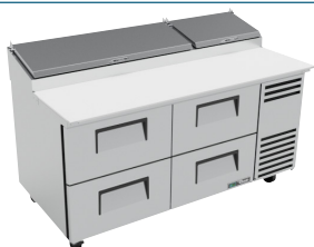
Front Left View