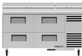
Straight-On Front View